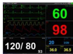
Big font interface