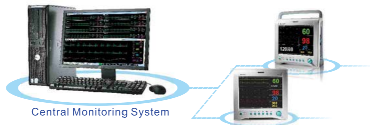
Central Monitoring System